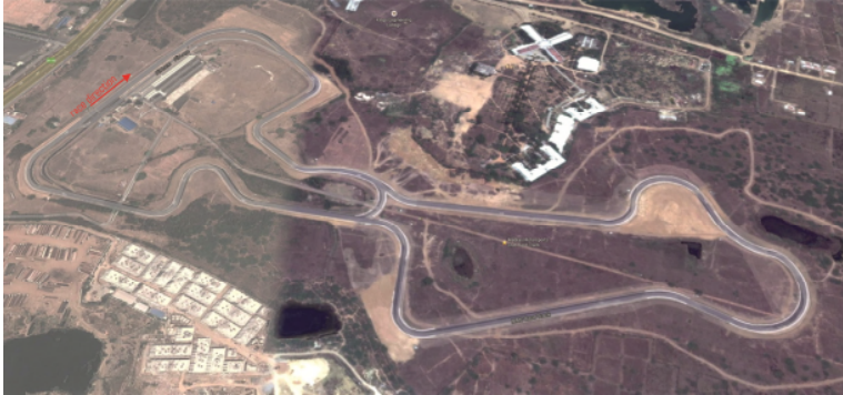
Madras Motor Race Track, Chennai