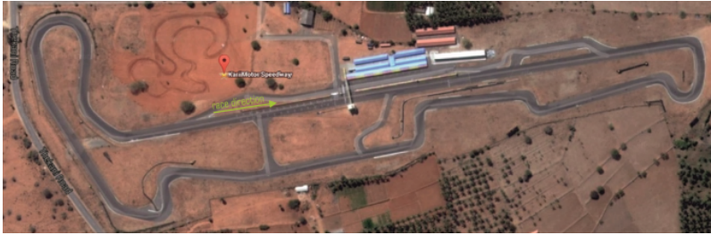
Kari Motor Speedway