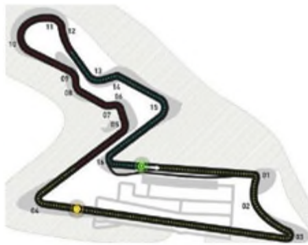
Buddh International Circuit