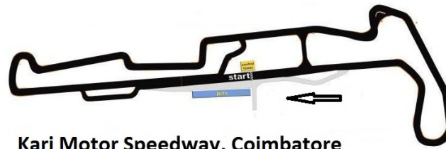
Kari Motor Speedway, Coimbatore