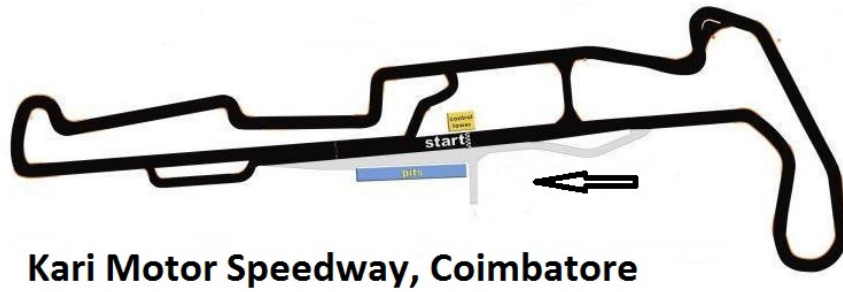
Kari Motor Speedway, Coimbatore