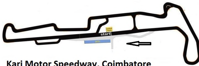
Kari Motor Speedway, Coimbatore