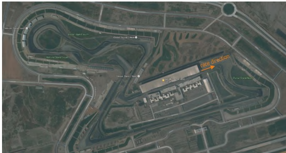
Buddh International Circuit, Greater Noida (Delhi NCR)