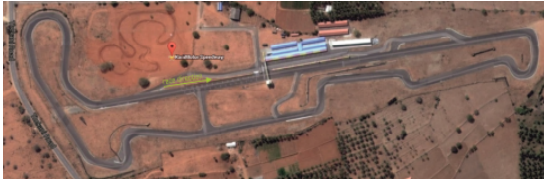
Kari Motor Speedway