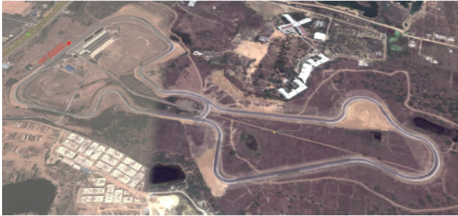
Madras Motor Race Track, Chennai